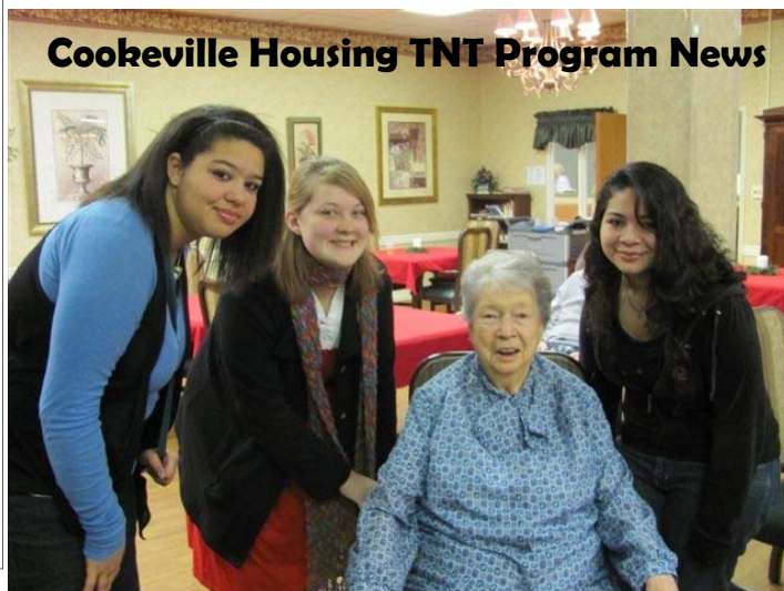
Cookeville Housing TNT Program News

For further information, instructions and the application, please contact the TAHRA office at tahra@att.net or (615) 776-1562. The deadline is April 11. Encourage and assist your deserving students!